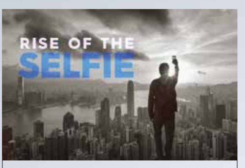
TECNO branded film The Rise of The Selfie on YouTube

Globally, TECNO is undoubtedly a dark horse that is championing the African market while gaining significant momentum and robust growth world-wide. So what makes TECNO a brand most admired by Africa? In a world driven by the rise of social media and young users, what is TECNO's strategy to hold on to and strengthen its leadership among future users? And what can we expect from the brand?